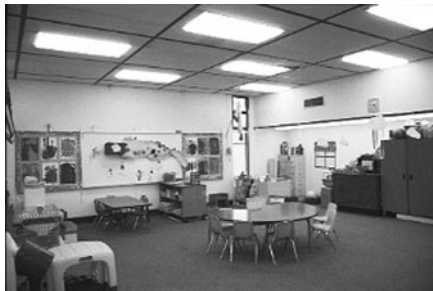
Figure 3—Classroom with window Code 1.